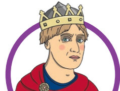
William the Conqueror