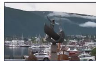
Fangstmonument (Arctic Hunter)