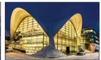
Tromso City Library and Archive