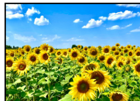
Plants can make new plants.