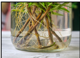
Plants need water .

We might not see a plant move, but we can still tell that it is alive.