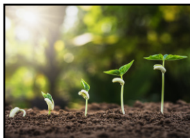
Plants grow and change .